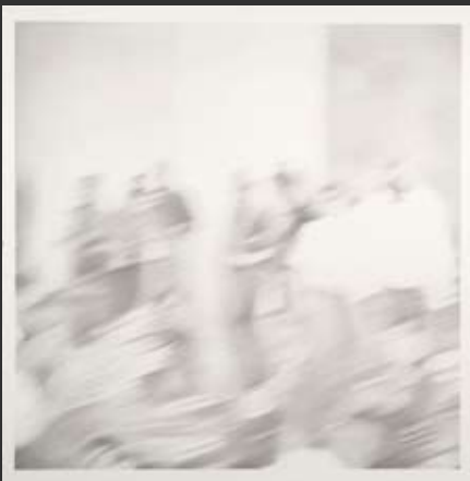
ZACATECAS #4, 2010, GRAPHITE, 22 X 22 INCHES