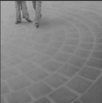
POR EL RIO DEL TIEMPO #3, 2010, GRAPHITE, 45 X 45 INCHES